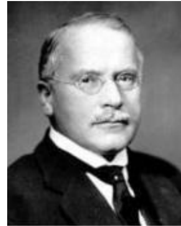
Carl Gustav Jung